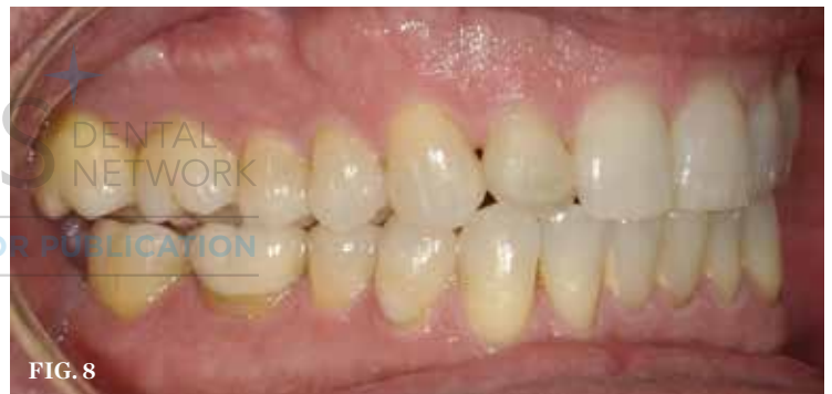
(3.) Postorthodontic delivery of MRD. (4.) Edge-to-edge bite resulting from 5-year use of MRD. (5.) Right side, unilateral posterior open bite resulting from 5-year use of MRD. (6.) Left side, posterior edge-to-edge bite resulting from 5-year use of MRD. (7.) Sleep appliance designed to fit over clear aligners during therapy. (8.) Results after 6 months of re-treatment utilizing clear aligners in conjunction with the sleep appliance.

these cases highlights the necessity of proper treatment planning and appliance selection when treating patients who suffer from sleep disorders as well as the need for regular, long-term follow-up of these patients.